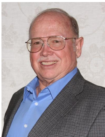
August 12, 1942 – February 21, 2025